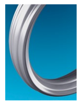
PERPETUAL ASSET MANAGEMENT

The Perpetual Ethical SRI Fund, one of Australia's first ESG funds recently celebrated its 20<sup>th</sup> birthday. To celebrate, we take a look back at some of the Fund's highlights, performance and how this single launch evolved to become the present suite of dedicated ESG investment strategies that sit within Perpetual Asset Management Australia (PAMA).